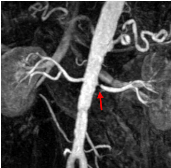
Fig. 1. Dynamic 3D gradient echo MR angiography (TE 1.9, TR 6.6, NEX 1, flip angle 25°, slice thickness 1.3 mm, field of view 320 mm with a 75 % phase resolution) was performed 30 seconds after i.v. bolus injection of the blood pool agent.

MR imaging was carried out in 2002 on a Siemens 1.5 T whole-body scanner. Time-of-flight MR angiography was performed (data not shown). The resulting TOF MR angiogram, acquired with the best standard sequence available to the institution, revealed indications of renal artery stenosis. However, it was not possible to make a detailed and reliable diagnosis. In addition, dynamic and steady-state MR angiography following intravenous injection of gadofosveset were performed.