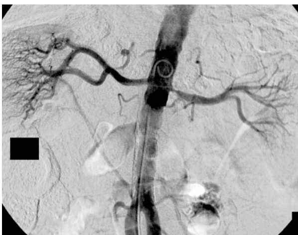
Fig. 3. Conventional catheter-based digital subtraction angiography establishes the diagnosis of significant stenosis of the left renal artery.

This steady-state MR angiogram shows significant stenosis of the left renal artery and regular opacification of the venous system. This image demonstrates the imaging potential of blood pool agents - even at a later time point (e.g. if the bolus is missed due to technical or patient-related problems). It also demonstrates the potential for imaging the venous system.